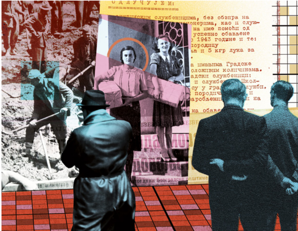
Between wage labour and coercion: The case of civil servants in occupied Serbia, 1941–1944.

Illustrator: Tim Robinson. Authors: Nataša Milićević and Ljubinka Škodrić.