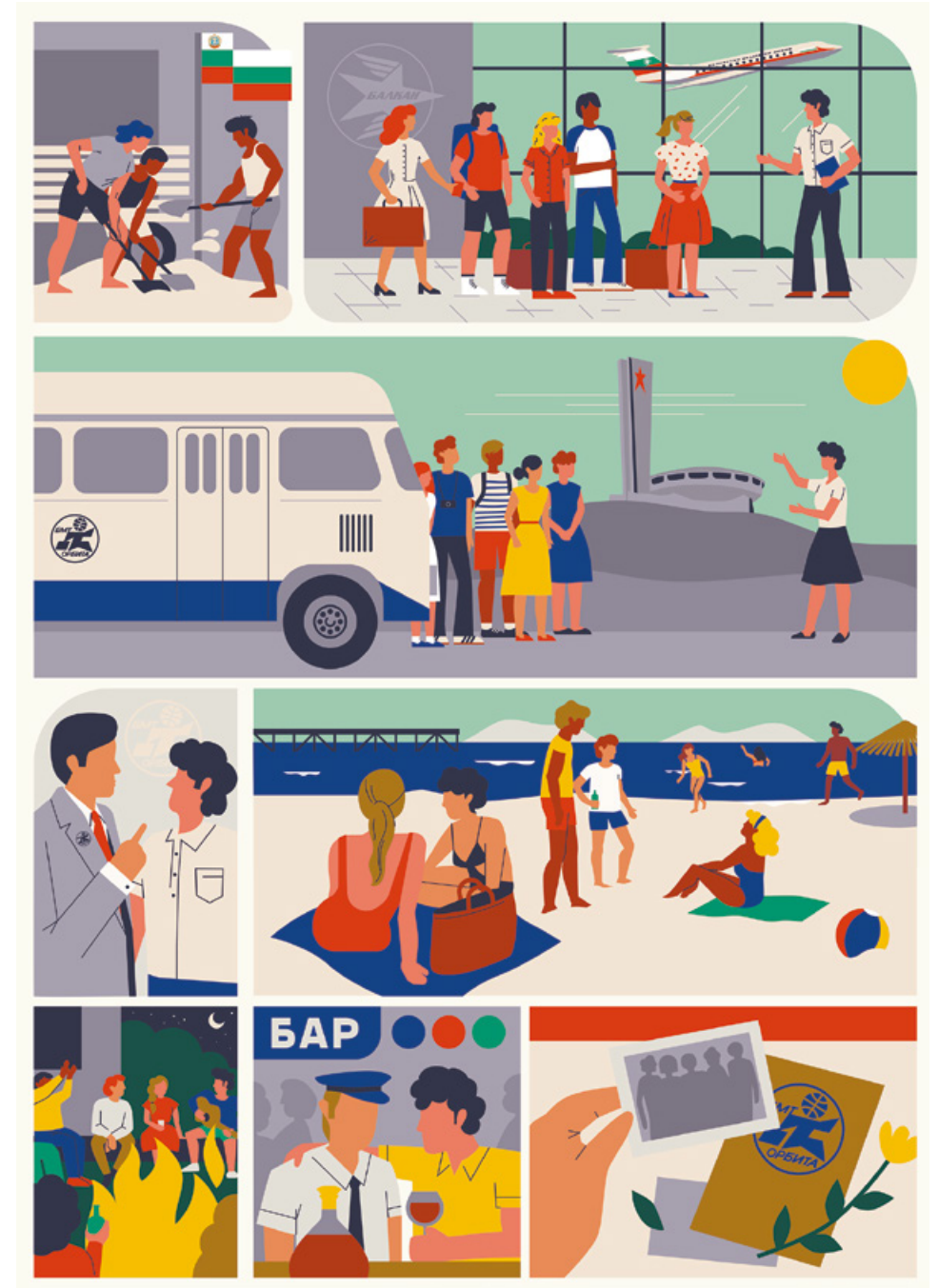
Links between labour coercion and wage labour in socialist Bulgaria:

Scenario for the illustration: Anamarija Batista & Corinna Peres.