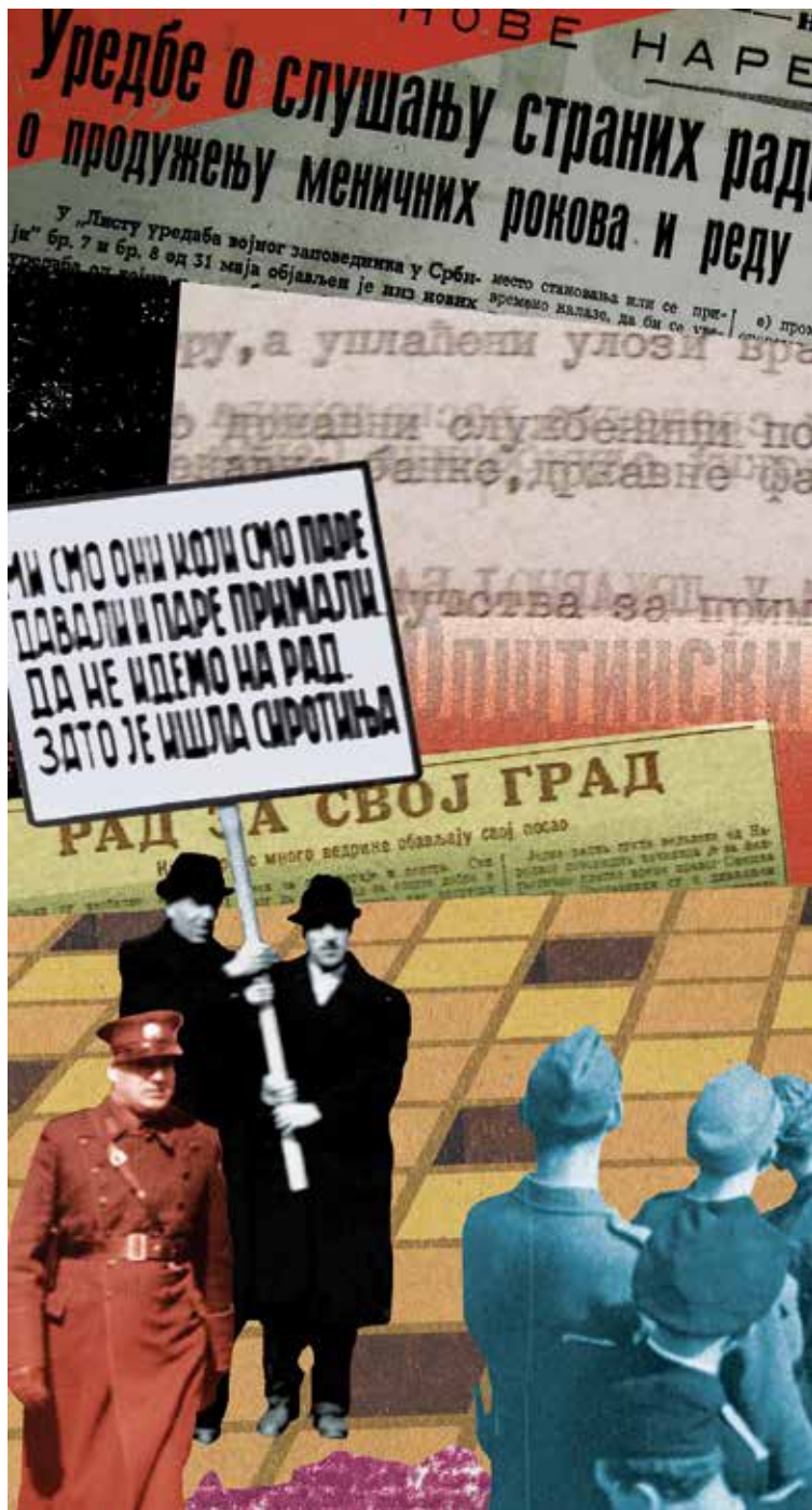
Between wage labour and coercion: The case of civil servants in occupied Serbia, 1941–1944.